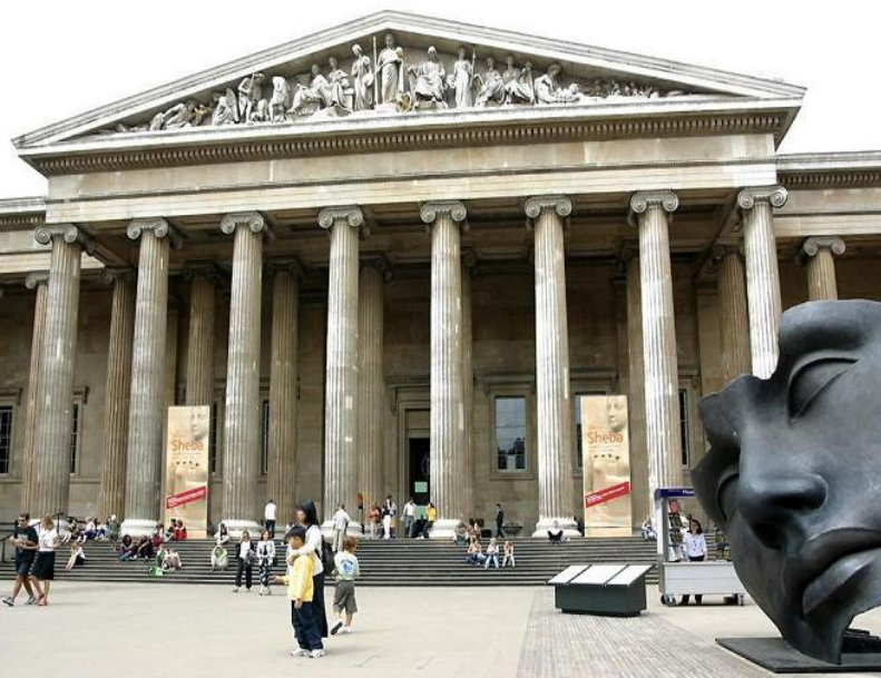
The British museum