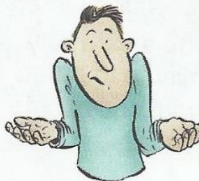
shrug your shoulders