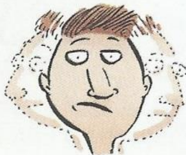
shake your head